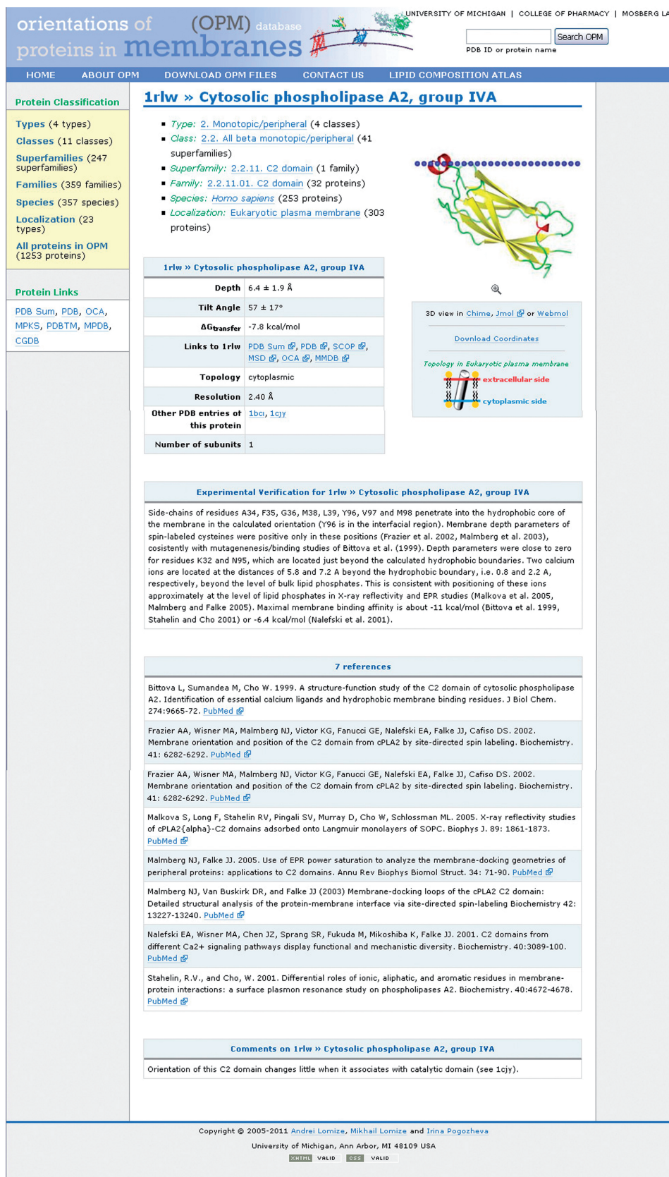
Figure 2. Example of entry page for C2 domain of peripheral protein phospholipase A2.